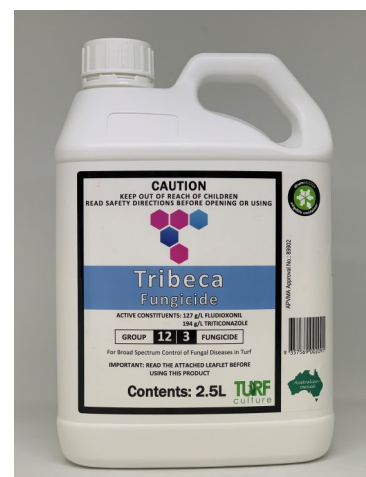
Packaging Pack size: 2.5 L

Root Diseases: Application volumes for root infecting diseases (Brown Patch, Couchgrass Decline, Spring Dead Spot and Take-all Patch) should be as high as possible (approximately 1000 L/ha) to ensure placement close to the soil surface. When lower application volumes are used, washing in should commence as soon as possible after application. Example: For best results use extremely coarse droplets [e.g. Turbo Floodjet (TF5) or TurfJet (TJ10)] and total application volume of approximately 1000 L/ha. The addition of a soil penetrant is recommended to ensure an even matrix flow through the soil profile. Preferably spray onto wet or dewy grass. Irrigate with 6 to 10 mm of water commencing within 1 hour of application (Note: the sooner Tribeca Fungicide is washed off the leaf and crown and incorporated into the rootzone the better the result).